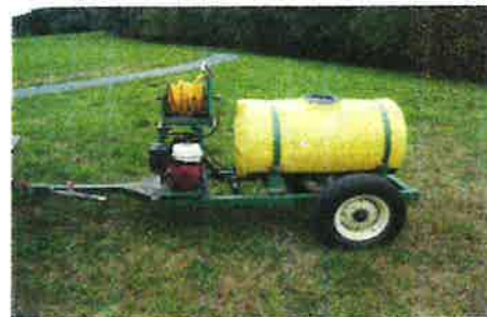
Sprayer used for the Rose Program

The Mountain Soil and Water Conservation District owns three poultry litter spreaders. They are used to help landowners spread their litter more efficiently and therefore help to improve water quality. It gives landowners a better understanding of nutrient management and the importance of following nutrient management plans. The District rents the spreaders out on a daily basis. During the year 54 days were utilized spreading litter and lime ( 53 days for poultry litter and 1 day of spreading lime.). This resulted in 2,365 acres being applied using "Mini-Nutrient" plans.