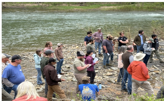
Members of the group listen with interest