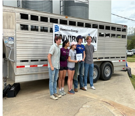
Second Place Team Massanutten Regional Governor's School