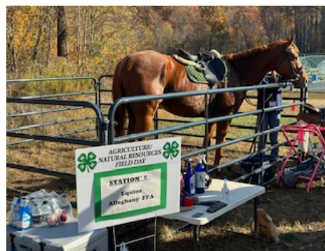
Alleghany Equine FFA