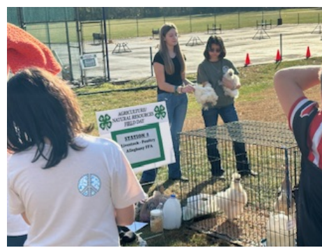
Alleghany Livestock Poultry FFA