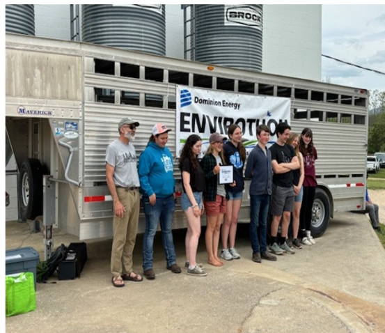
Third Place Team Eastern Mennonite High School

The District made a donation again this year to be used by a student for Forestry Camp held at Holiday Lake.