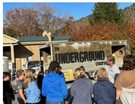
The Underground Classroom was a "big hit" for the students.