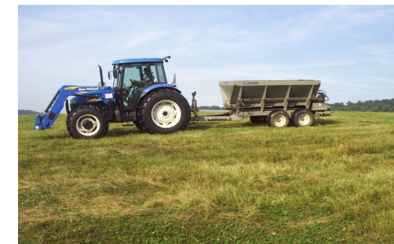
Bath County Farmer using Spreader

The Mountain Soil and Water Conservation District is heavily involved in the administration and coordination of Bath County's multi-flora rose program. During the year 41 landowners were serviced with 2,114 acres of land treated. This resulted in 80 mixes of spray being distributed. The County of Bath purchased 143 (2 oz.) containers of Ally and 71 gallons of Aquagene.