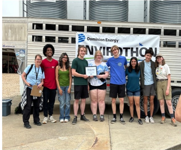
First Place Team Harrisonburg High School