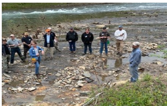
Members of the group along the Cowpasture River